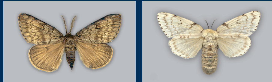
Spongy moth ( Lymantria dispar ): male left, female right

Deadline for Applications: Feb 28, 2023.