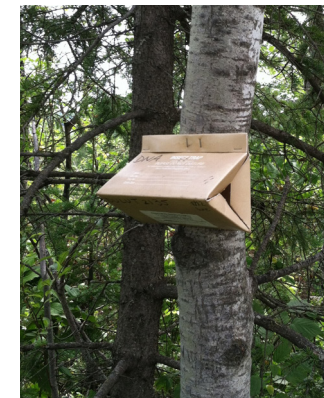
Spongy Moth Detection Trap

and report to a lead surveyor. Surveyors work based out of their home office which is close to or within their survey route. A reliable vehicle is necessary for driving survey routes. Mileage is reimbursed.